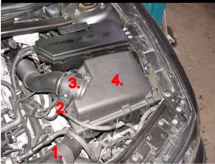
1. Disassembly: Inlet pipe (1), electrical plug (2) for MAS (mass air sensor), MAS (3) from air filter box (4).