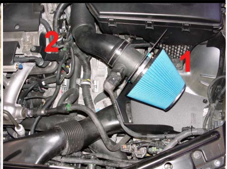
4. Disassemble the screw (1) for the fuse box. Assemble the clips (supplied), holding the MAS on the heat shield. Assembly: Fit the heat shield into the original attachment suspension and attach the screw to the fuse box. Attach the MAS to the heat shield with the supplied screws. Mount the BSR air-filter, electrical plug to MAS and inlet pipe. Attach the magnetic valve as picture shows. Use the supplied bracket (2).