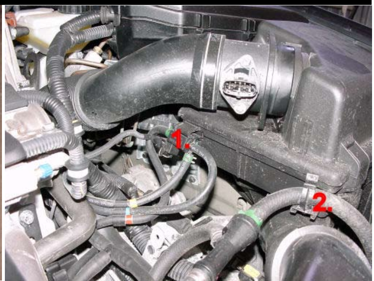
2. Disassemble the magnetic valve (1) and the hose (2) from the air filter box.